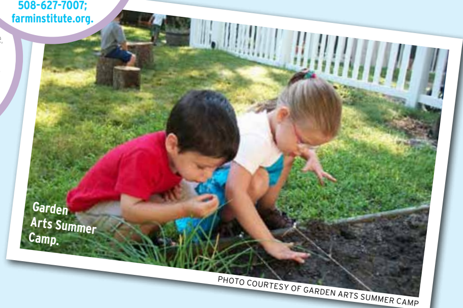
Garden Arts Summer Camp.