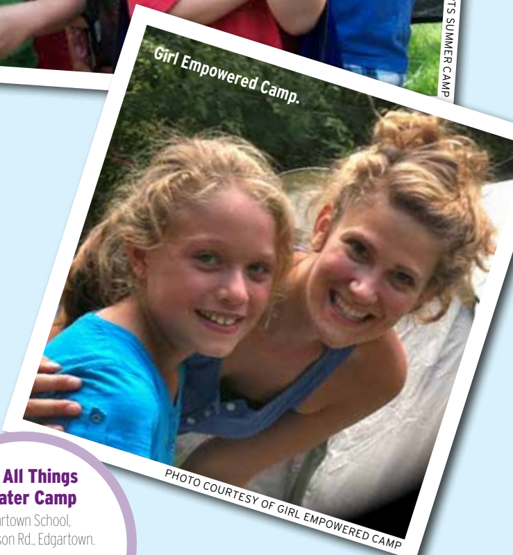
Girl Empowered Camp.