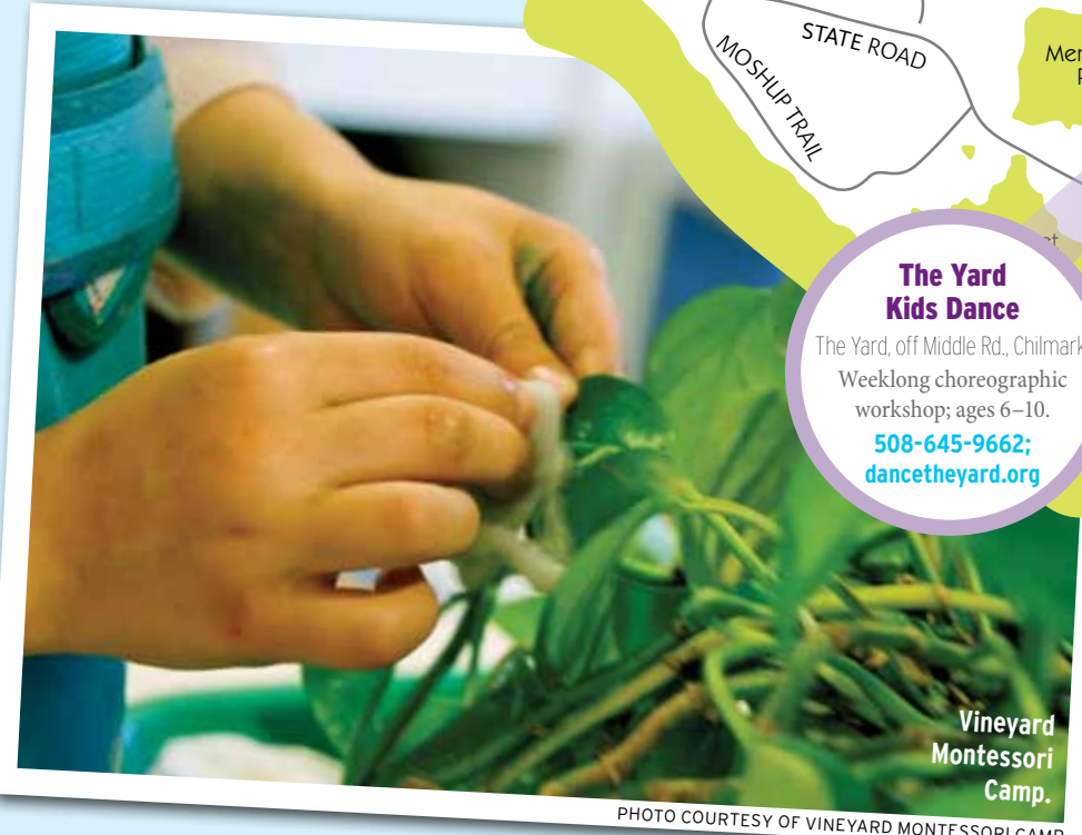
Vineyard Montessori Camp.