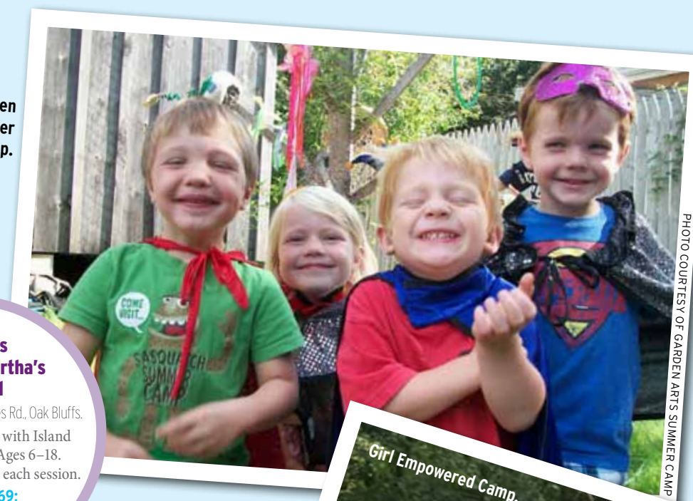
Garden Arts Summer Camp.