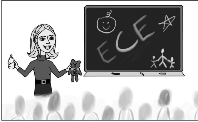
ILLUSTRATION BY MADELINE BENGTTSSON

In the past, ECE classes were offered remotely as a dual-enrollment program