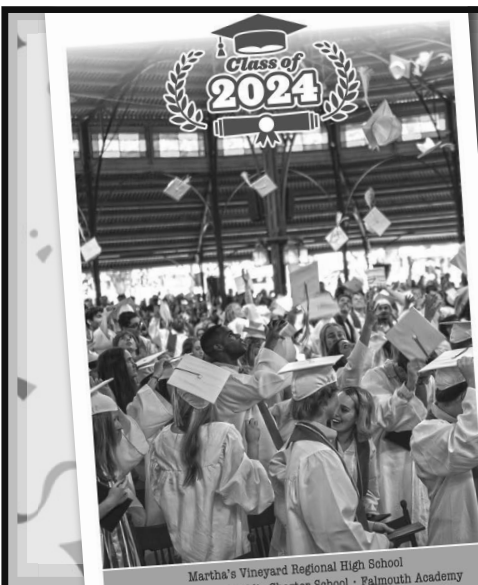
Martha's Vineyard Regional High School Martha's Vineyard Regional High School • Palmouth Academy